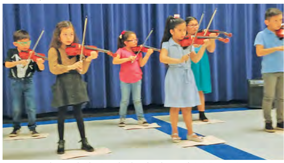
Students stand with poise and pride as they showcase their violin repertoire.

musicians perform in a mid-semester concert showcasing their musical growth. Students play an age-appropriate repertoire that shows off their musical talents to family and friends. Although the program started in January, the weekly classes will prepare these mini musicians for their Finale Concert at Biola University in May.