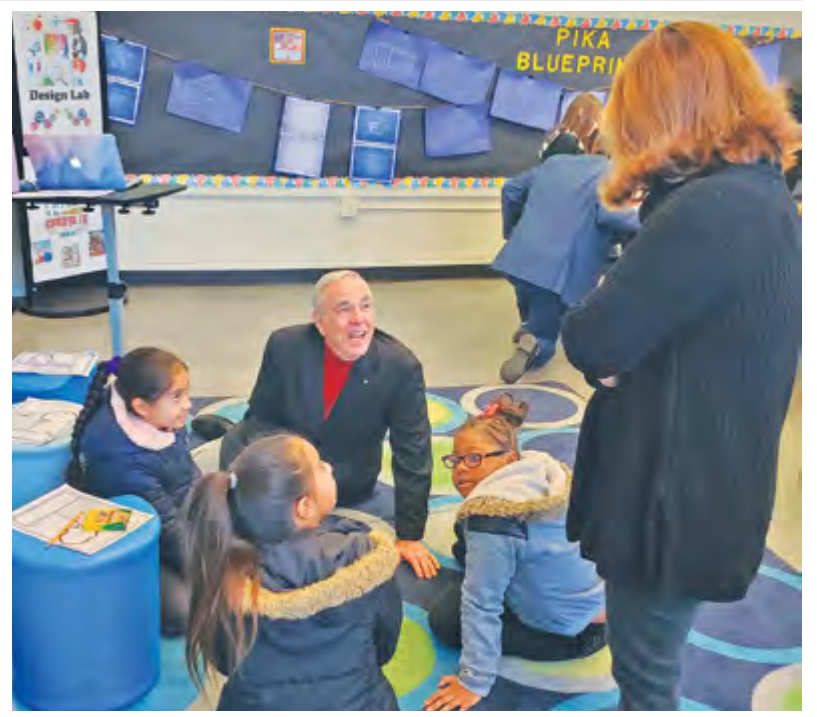
Orangethorpe ORCAs were so pleased to show off our new design lab to parents, FSD board members, school district VIP's and members of our larger Fullerton community.

microphone for use during classroom Writers Workshop presentations. This creative workspace is used by all students Kindergarten through sixth grade. Some of the other projects students have embarked on include: fifth graders solving design problems for consumers (each student was their partner's client) in a challenge involving designing a better backpack. Another project completed by sixth graders focused on building a home to save the endangered pika of North America. Since the installation of this lab all students on our campus have utilized this amazing learning space as an avenue to increase their creative thinking and problem-solving skills. What a time to be an ORCA!