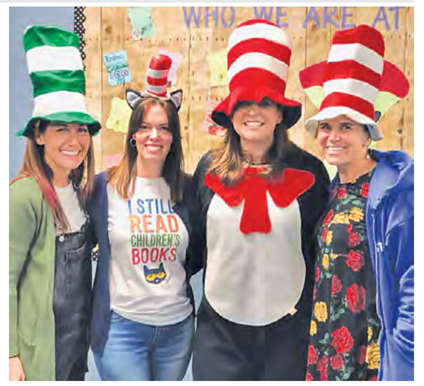
Staff getting in the spirit of celebrating Read Across America Week.

wore red and blue to align with One Fish, Two Fish, Red Fish, Blue Fish, we wore our favorite hats to show our enjoyment of Cat in the Hat, and we got to be silly by wearing our clothes backwards, inside out, or mismatched to show our appreciation of Wacky Wednesday. Silly socks were also worn to go along with Fox in Socks and college shirts were worn to acknowledge our bright futures as we made connections to Oh the Places You'll Go. From guest readers, reading rotations, and readers' theater to book picnic parties, STEAM activities, and art projects, it was a great week to be a Seahawk!