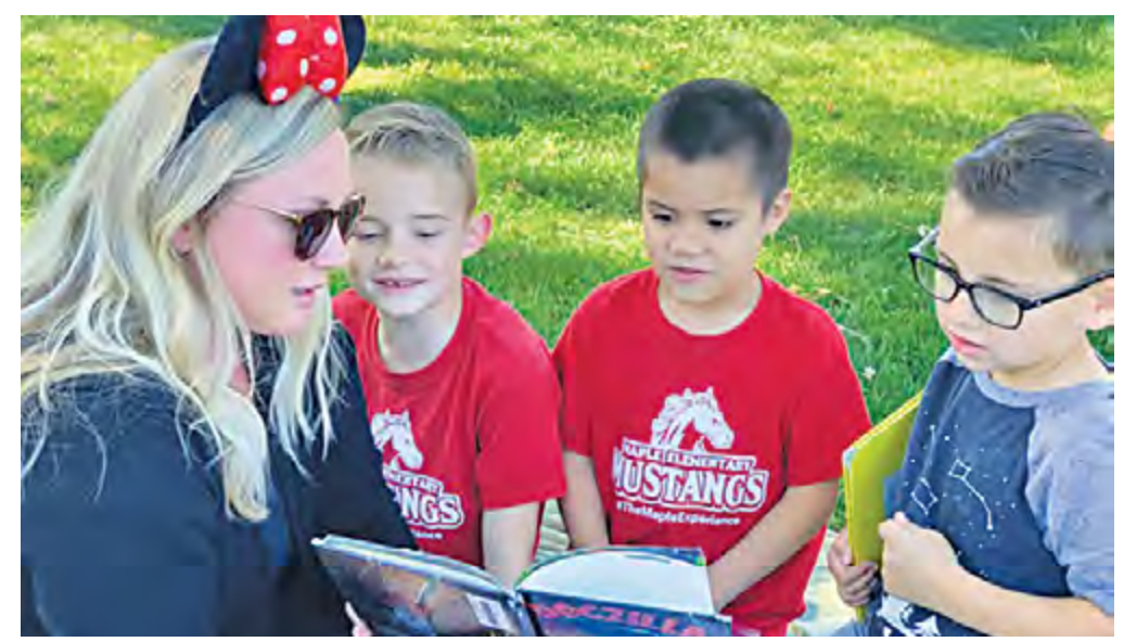
Students and families read together on the field during Maple's Book-nic!

Throughout the week, students earned tickets for extraordinary reading behaviors, and these tickets were drawn on Friday, every hour on the hour. Each hour, a ticket was drawn from each class, and the lucky winners won a free book gift certificate for the Book Fair!